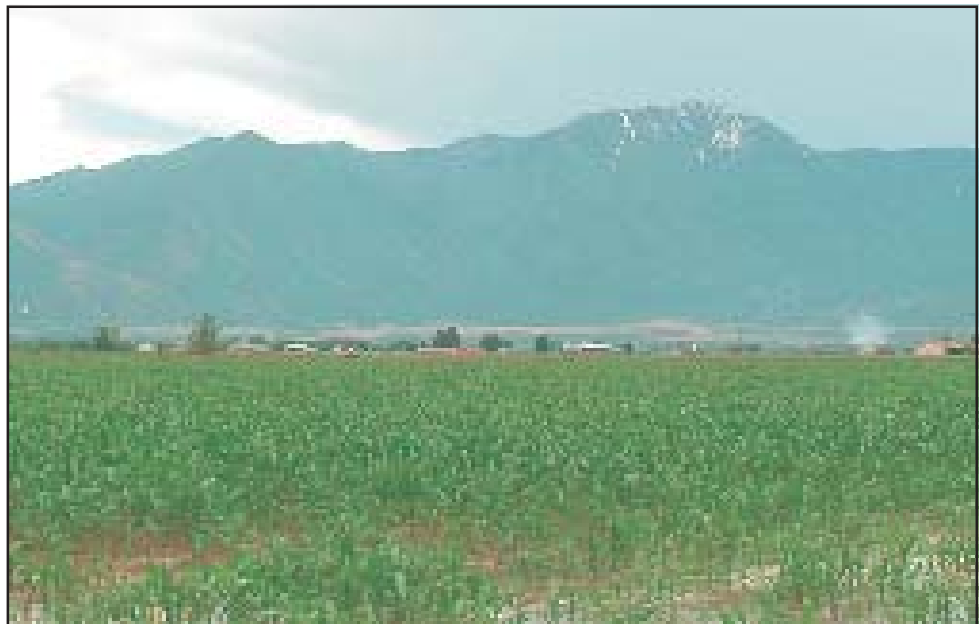
Photo today of the beautiful little cornfield with NO weeds. GPS - 40 7.752.-111 42.886

Es was an optimistic man and continued to work the field. As the growing season progressed, the corn stalks grew tall and produced an abundant harvest. The little cornfield had finally become his field of dreams. To this day that cornfield is still producing beautiful crops.