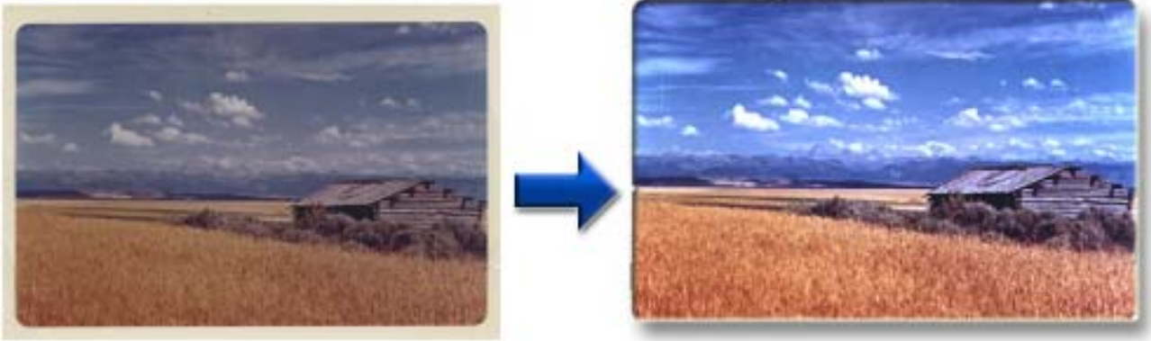
The photo above was dramatically improved using the free enhancement tools that came with the scanner.

You'd be wrong if you thought I used some wizardry in Photoshop or some high powered graphics enhancement program to bring out all the hidden treasures in the old photos.