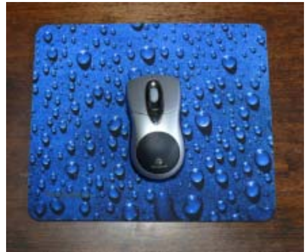
Targus wireless mouse and mouse pad

My Microsoft Wireless 7000 Laser mouse. It has a range of 30 feet so it is perfect to use with the big screen TV. This mouse is also rechargeable, has a magnifier and works with the wireless keyboard.