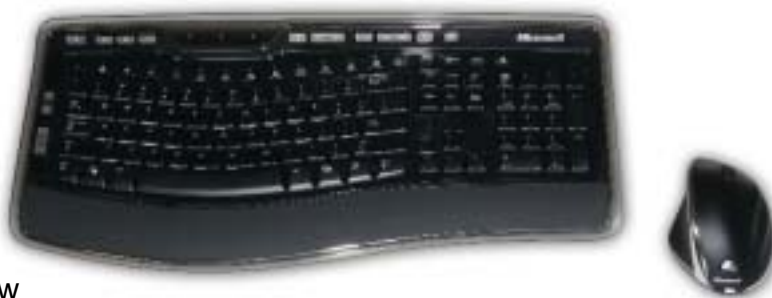
Microsoft® Wireless Laser Desktop 7000

You might as well go for broke. Get a wireless mouse and keyboard at the same time. You will also be amazed at how tired your keys are getting. When I purchased my new wireless mouse and keyboard I discovered my old keyboard had become like typing on a piece of cement. No joke! Springy new keys with letters you can actually read in the dark will make a big difference!